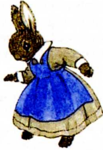
Alison Uttley and Little Grey Rabbit